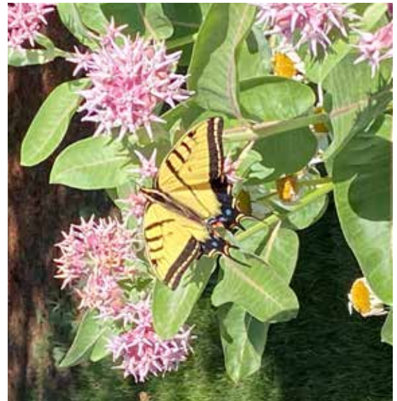
Just a pretty picture of a butterfly on a Milk Weed plant in our treasurer's backyard!

Fridays, 5:30 PM Library Game Night (Teens) Fridays, 8:00 PM Library Game Night (Adults)