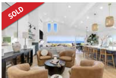
33771 Via Capri, Dana Point