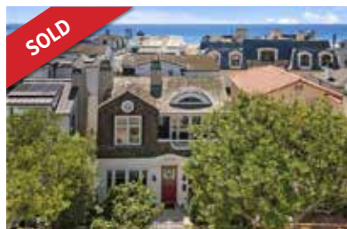
2149 E Ocean Blvd, Newport Beach

Wishing you a year filled with big wins, steady growth, and all the happiness you deserve.