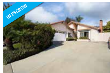
26445 Sandy Creek, Lake Forest