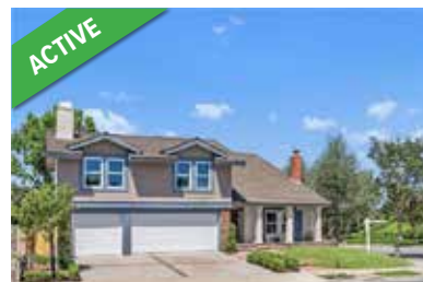
29141 Bobolink Dr, Laguna Niguel