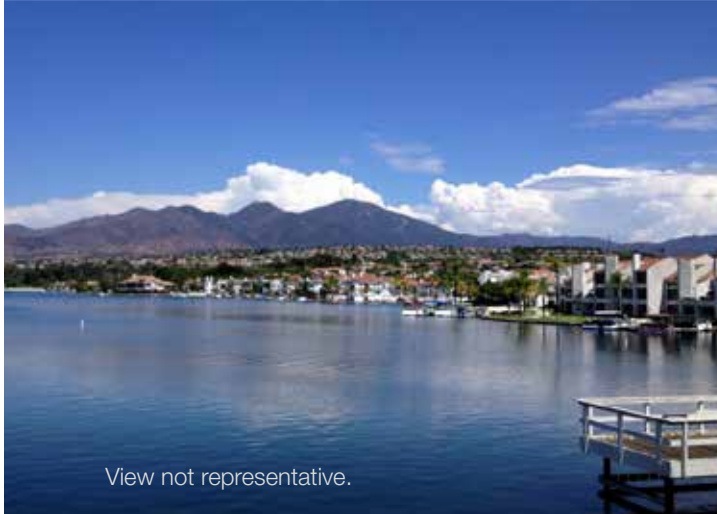
View not representative.

Let's create your strategic blueprint so you can further your long-term personal success.