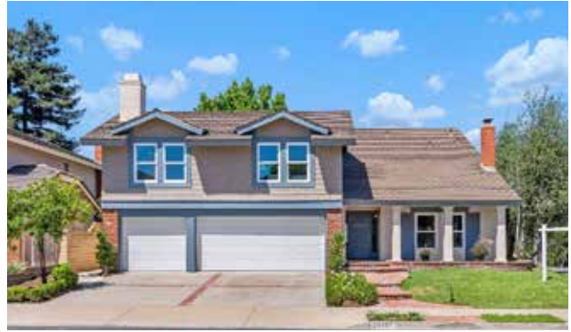
ACTIVE | 29141 Bobolink Drive, Laguna Niguel $2,545,000 | 4 Bed + Bonus Room, 3 Bath, | Approx 3,336 Sq Ft