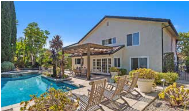
JUST SOLD | 24002 Plover Lane, Laguna Niguel 4 Bed, 3 Bath | Approx 2,722 Sq Ft