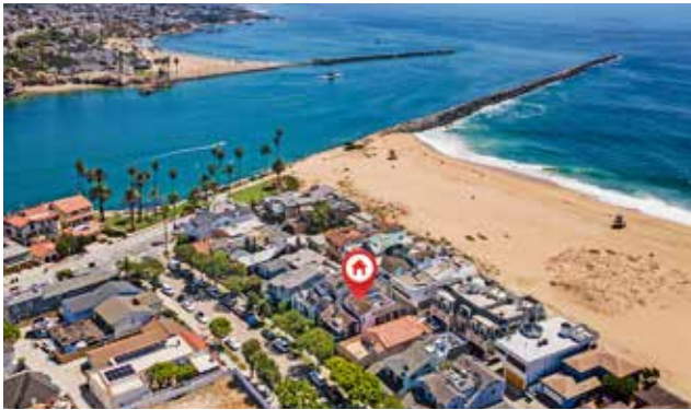
NEWLY LISTED | 2149 E Ocean Blvd., Newport Beach $6,750,000 | 3+ Bed, 5 Bath, Newer Construction 1 House Off The Sand And 4 Houses From The Wedge