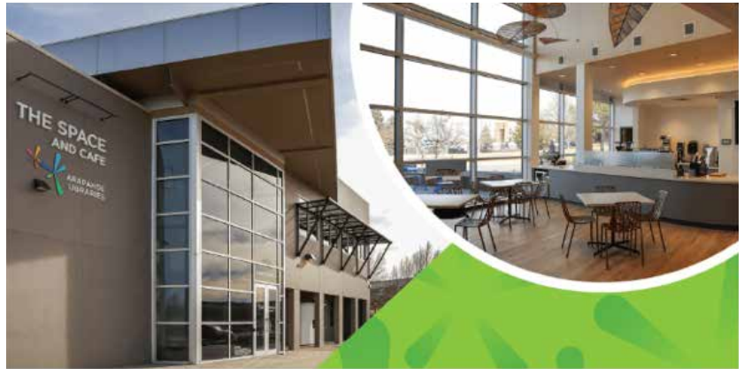
The Space and Café by Arapahoe Libraries

The Space opened in late January in a recently renovated area of the Arapahoe Library Services Building. Located at 12855 E. Adam Aircraft Cir., (across Broncos Parkway from the Sheriff's Building), The Space features a cafe, coworking space, meeting rooms and event space. It is designed to meet a growing demand for public meeting space in the community. A segment of the building will be retained for library administrative use. Meeting spaces (can accommodate 30-160 people) and co-working spaces are open from 8:00am-9:00pm Monday - Thursday, 8:00am-4:00pm on Friday. Free to the public. The Space Cafe is open 8am-3pm Monday-Friday.