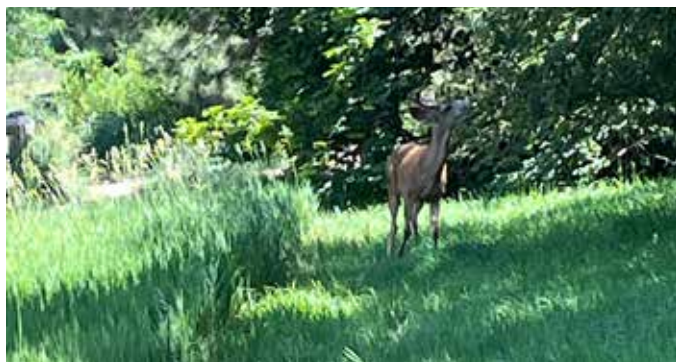
A deer was seen in the east-side greenbelt on June 22.

This Space Intentionally Left Blank for Teen Services