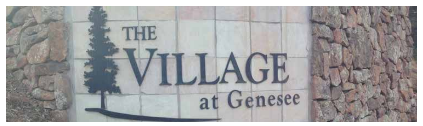
The monthly newsletter for the residents of Genesee Village