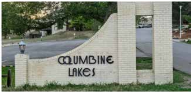
Columbine Lakes Community >

Thank you to the volunteers who helped organize it!