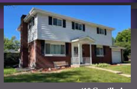
410 Costilla Ave. Centennial, CO 80122 4 Beds/4 Baths/2,896 Sq. Ft./1 Car garage Sold 7/24/23 for $590,000

What's your home really worth? Pricing a home correctly is critical in this market to optimize your sale. Call a trusted agent who is familiar with the neighborhood and can help you sell at the highest price possible. Call me if you would like to know your home value!