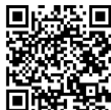
Scan to Pay