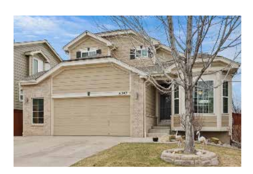
UNDER CONTRACT $788,900

6247 S Miller Court 3 bed/4 bath; 2,792 square feet