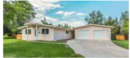
5445 W Caryl Pl.