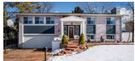
7984 S Newland Ct.