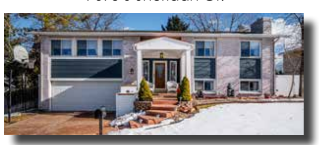
7984 S Newland Ct.