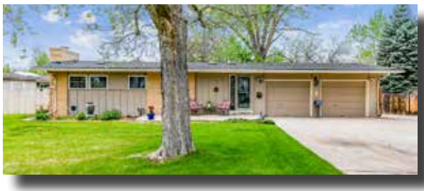
7695 S Sheridan Ct.