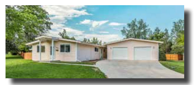
5445 W Caryl Pl.