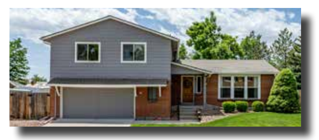
6552 W Morraine Pl.