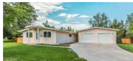
5445 W Caryl Pl.