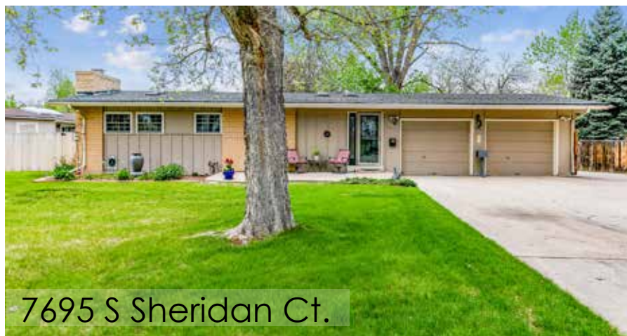
7695 S Sheridan Ct.