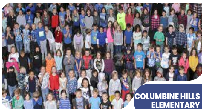
COLUMBINE HILLS ELEMENTARY