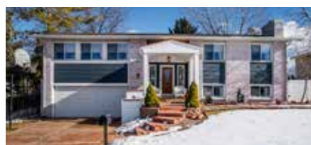
7984 S Newland Ct.