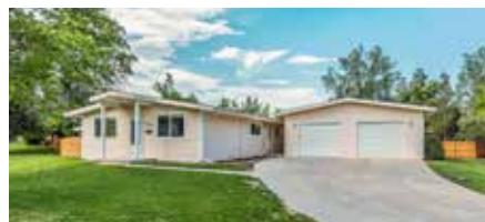
5445 W Caryl Pl.