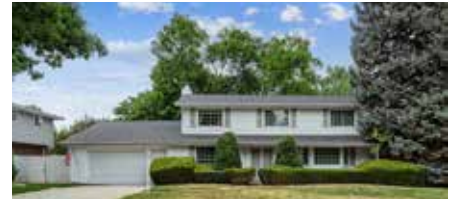
7129 S Marshall St.