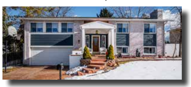
7984 S Newland Ct.