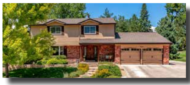
7349 S Jay St.