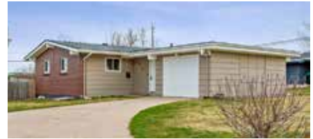
5824 W Alder Ave.

DUANE C. DUFFY • 303-229-5911 • DUANE@DUANECDUFFY.COM Call Duane for a market analysis or any real estate questions you may have!