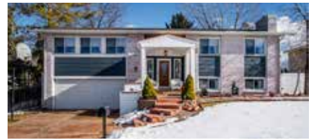
7984 S Newland Ct.