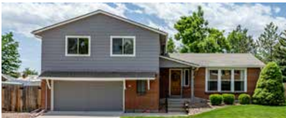
6552 W Moraine Pl.