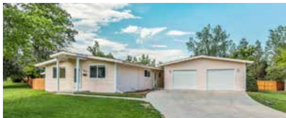
5445 W Caryl Pl.