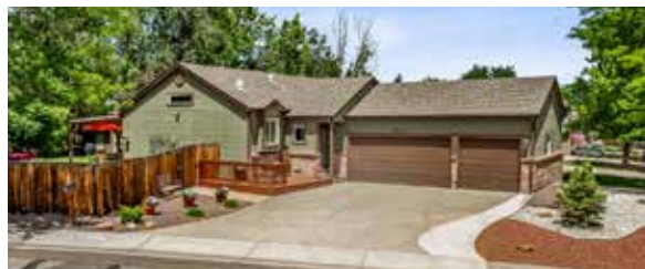
7809 W Hoover Pl.