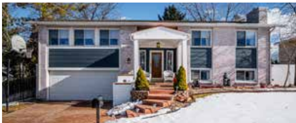
7984 S Newland Ct.