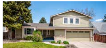
7863 W Quarto Ave.