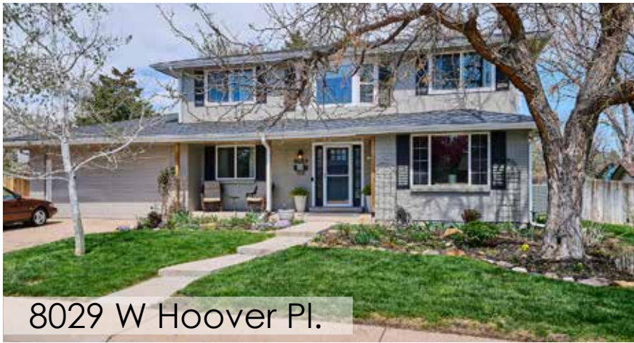
8029 W Hoover Pl.