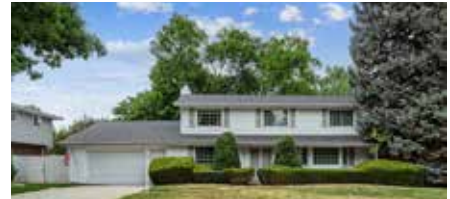
7129 S Marshall St.