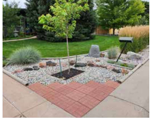
6322 W. Elmhurst Ave.