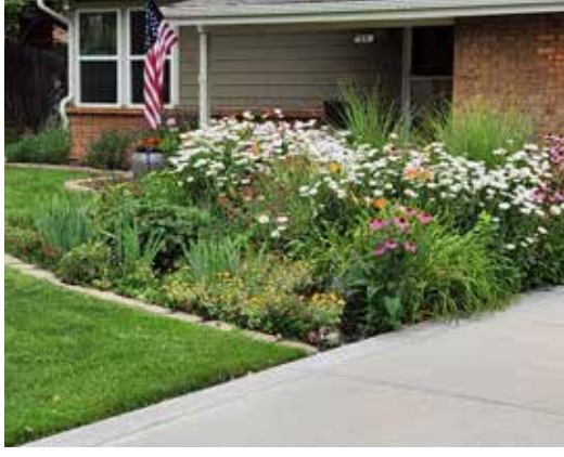
7991 S. Lamar St.