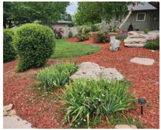
8060 S. Kendall Blvd.