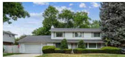
7129 S Marshall St.