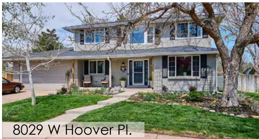
8029 W Hoover Pl.