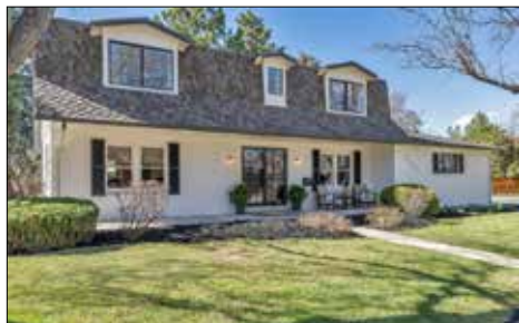
7105 S Depew Street Littleton, CO $1,170,000