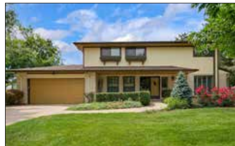
5477 W Portland Drive Littleton, CO $845,000

Looking to Buy or Sell, I would love to help you. Give me a call!