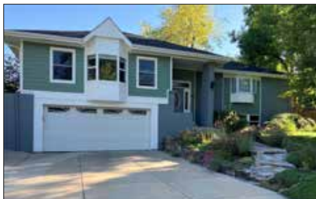
5480 W Rowland Avenue Littleton, CO $813,500