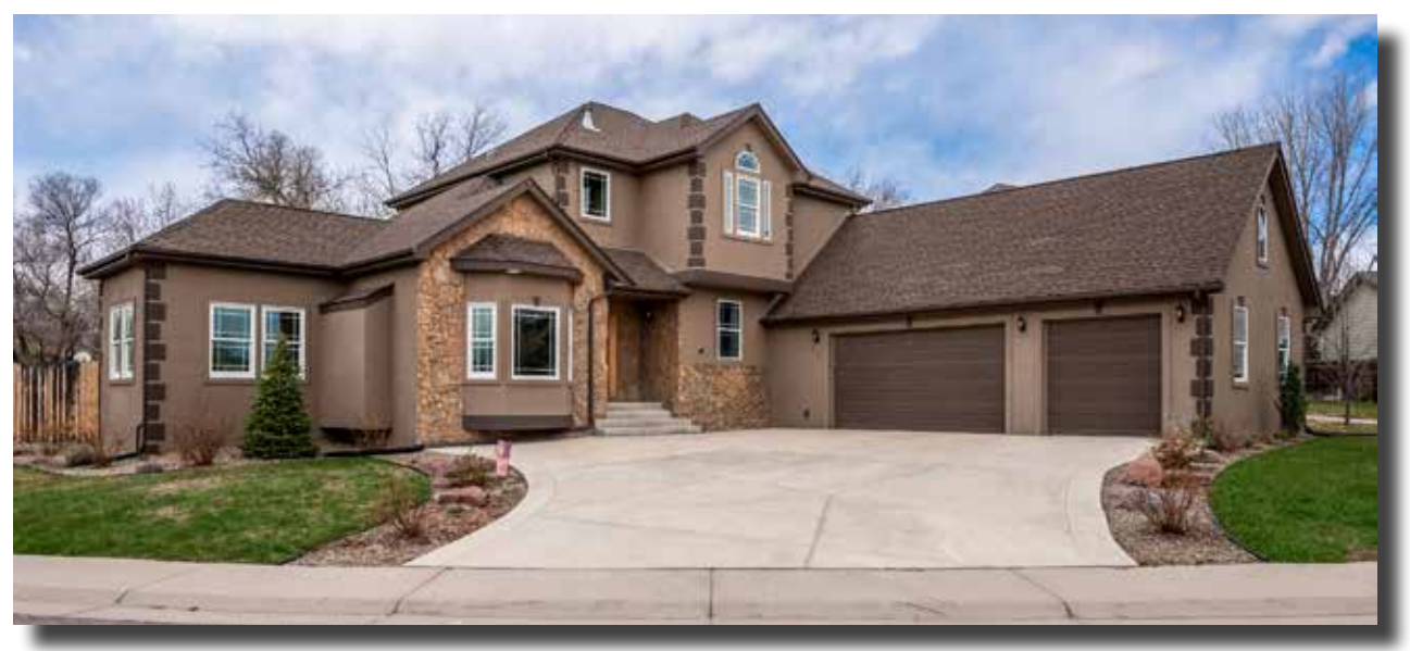
6881 S Reed Ct.