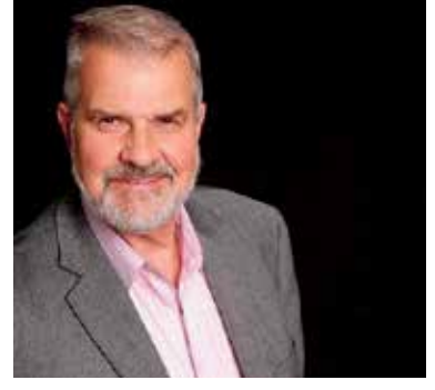
LET ME HELP YOU LIVE THE AMERICAN DREAM!