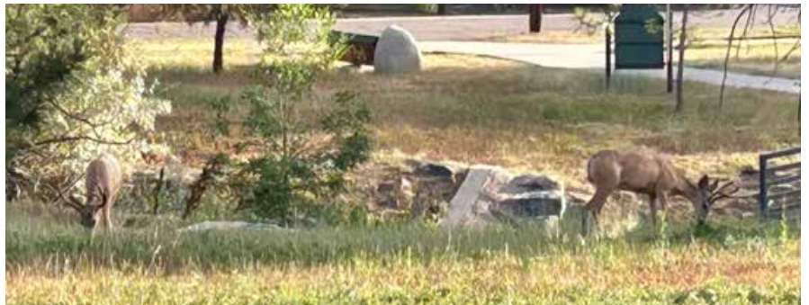
Photos captured from neighbors of wildlife in DCV. (wild turkey in neighbor's backyard, 2 beavers in Dutch Creek, and 2 deer along trail)