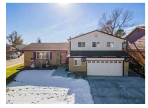
8908 W Maplewood Dr - $635,000

Great home on corner lot featuring a new kitchen, hardwood floors, new Trex decking and new carpet. This 3 bedroom, 3 bath home is just right for you!