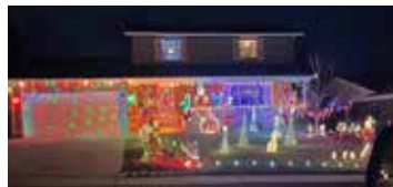
3rd Place Tie: 6348 Chase Ct.