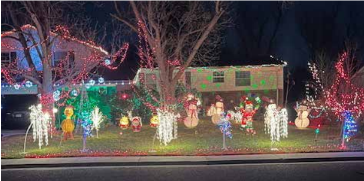
1st Place: 5495 W Leawood Dr.

In first place was 5495 W Leawood Dr.; second place was 6212 Ames Ct.; third was a tie between 6287 S Benton and 6348 Chase Ct. Thank you for spreading holiday cheer and we're all looking forward to seeing what people do at the end of 2026.