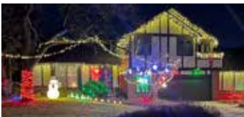
3rd Place Tie: 6287 S Benton