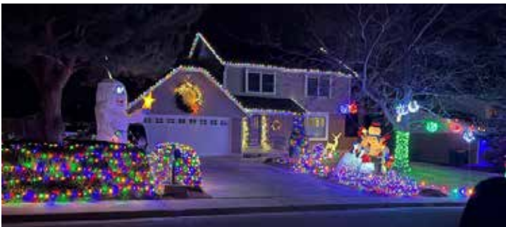
2nd Place: 6212 Ames Ct.