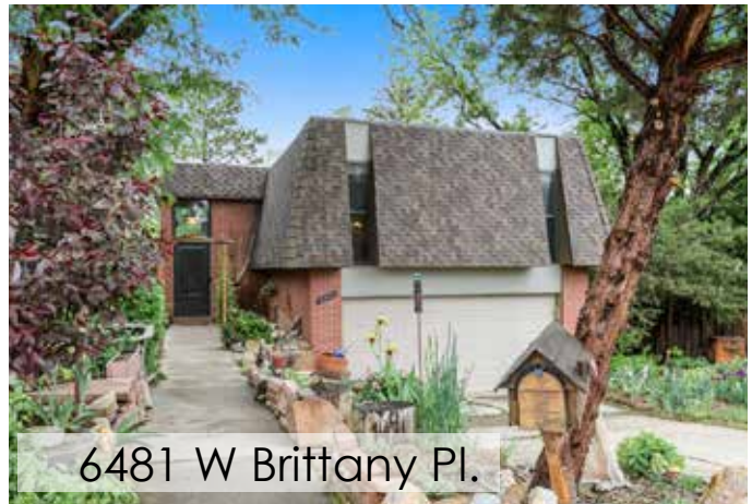
6481 W Brittany Pl.