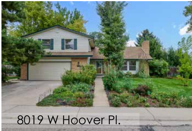
8019 W Hoover Pl.