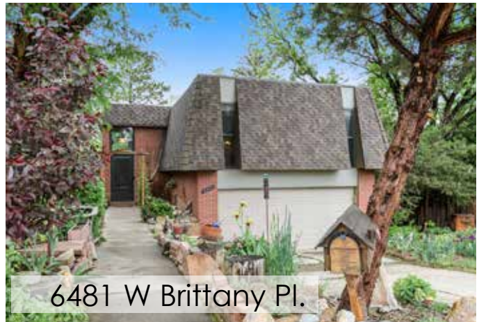
6481 W Brittany Pl.