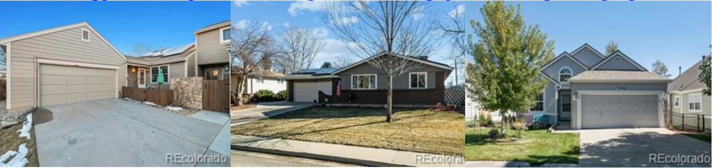
6683 S Yukon Way $525,000

Call Gary for more information or a private showing of these or any other properties