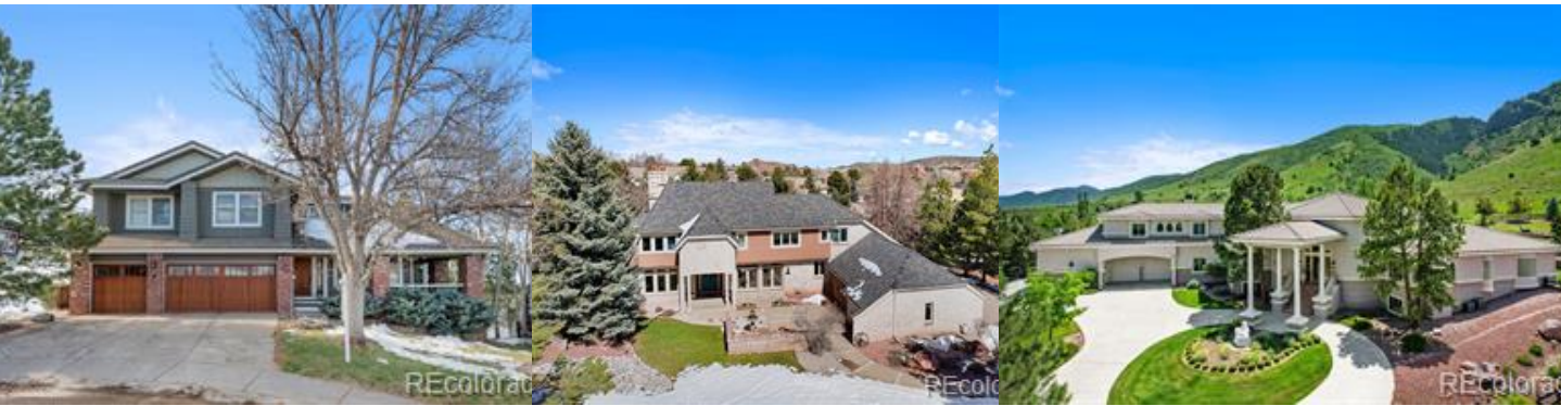
15 Lindenwood Ln $1,699,000