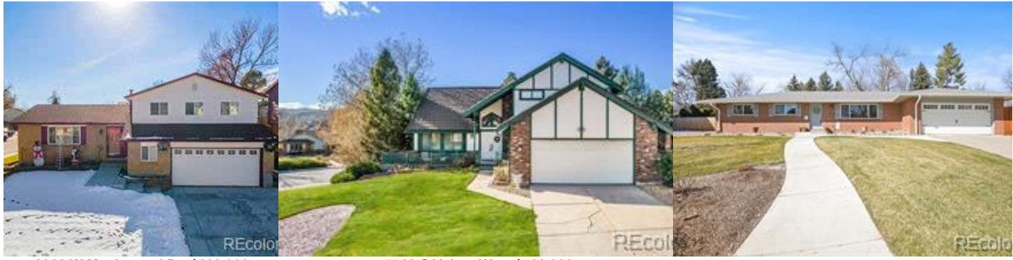
8908 W Maplewood Dr $630,000