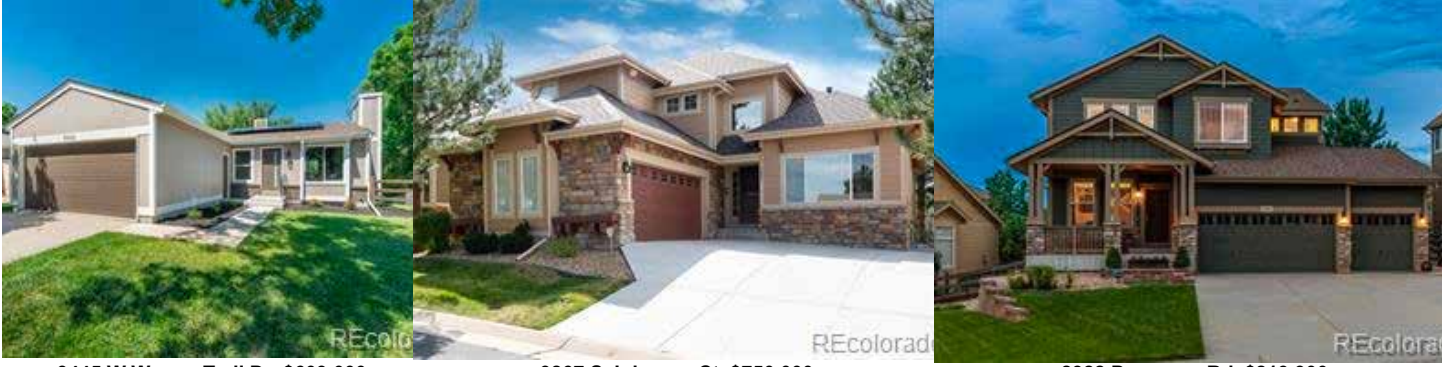
9445 W Wagon Trail Dr $609,000