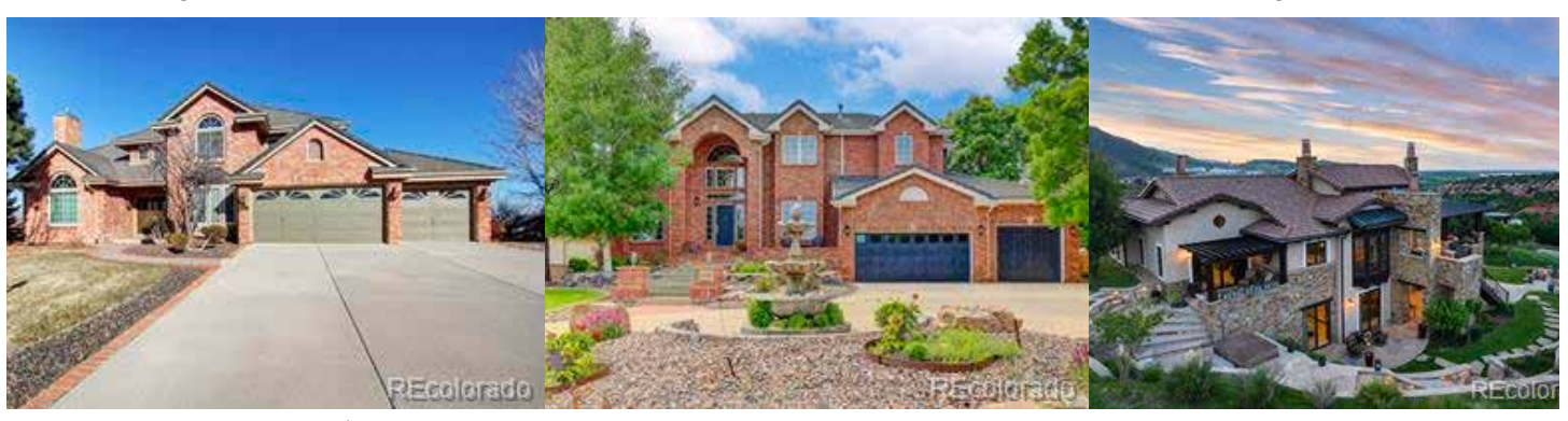
6845 W Princeton Ave $2,135,000