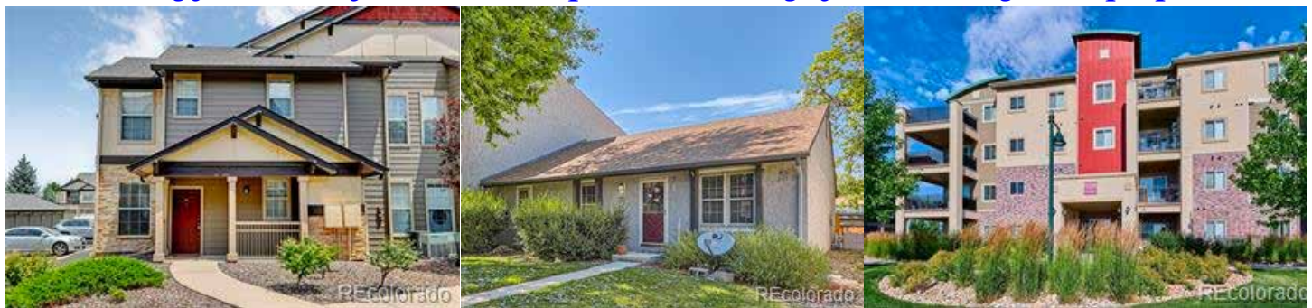
7413 S Quail Cir, Unit 1417 $379,000

Call Gary for more information or a private showing of these or any other properties