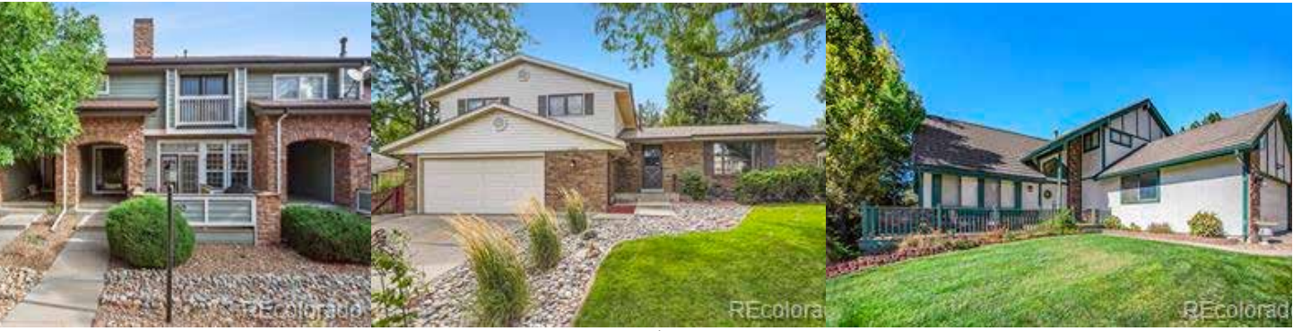
2750 W Greens Ct $585,000