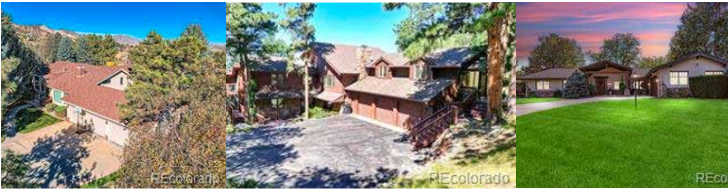
6431 Crestbrook Dr $1,895,000