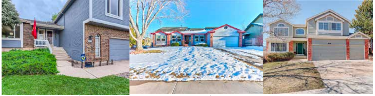
10936 W Polk Dr $655,000