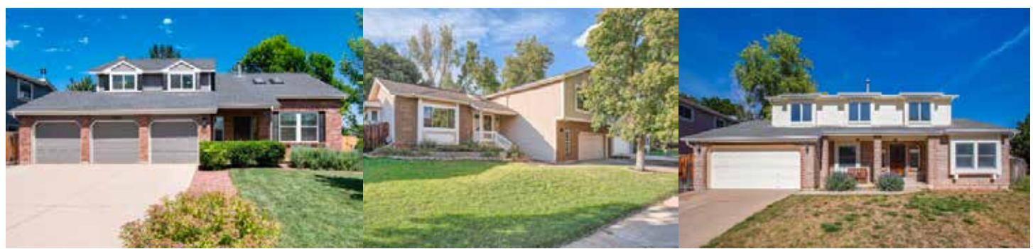
11069 W Walker Dr $675,000