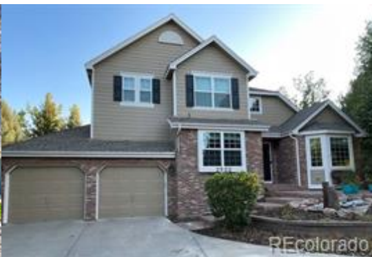
2522 W Dry Creek Ct $969,900