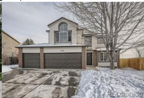
6550 S Oak Ct $775,000

I donate a portion of my commission to Childrens Miracle Network & Professionals Miracles Foundation