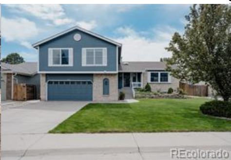
6386 S Pierson St $775,000