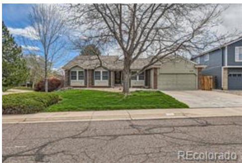
6376 S Pierson St $739,000