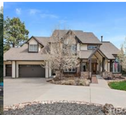
4 White Fur Ct $2,399,000