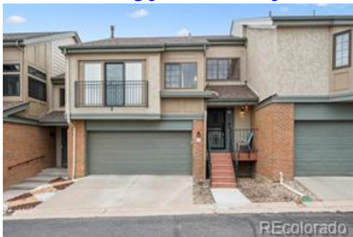
7450 W Coal Mine Ave, unit D $480,000

Call Gary for more information or a private showing of these or any other properties