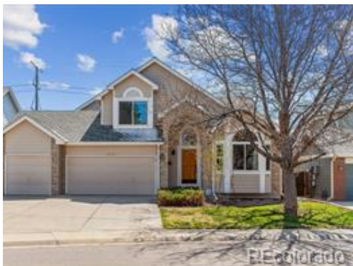
10470 W Cooper Pl $899,000