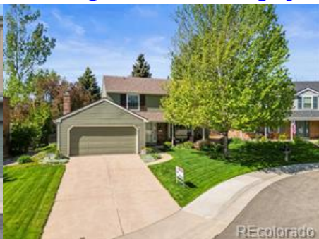
9706 W Hinsdale Pl $585,000