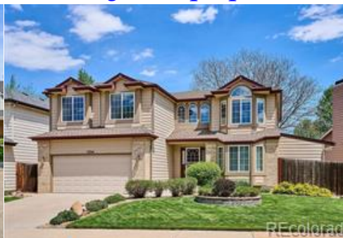
7354 S Robb St $824,900