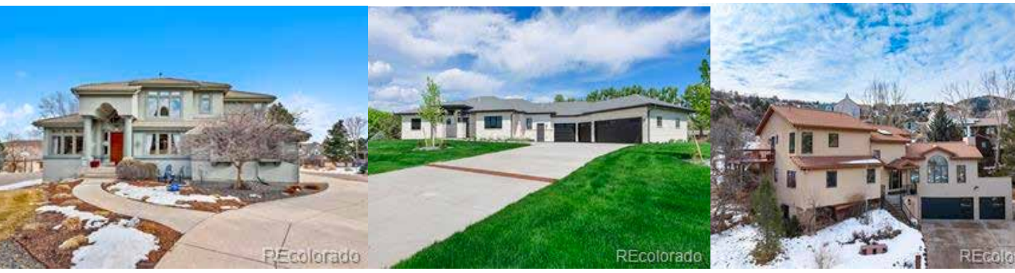
4 Kokanee $1,799,000