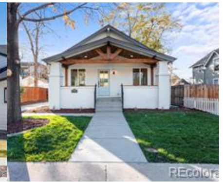
5543 S Prince St $899,000