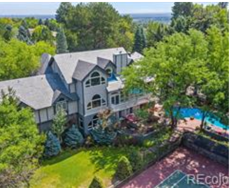
6250 W Lakeridge Rd $3,650,000

I donate a portion of my commission to Childrens Miracle Foundation