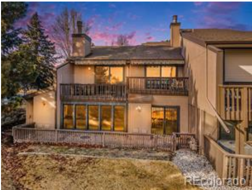
7300 W Stetson Pl $764,200