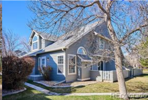
4986 S Nelson St Unit B $600,000