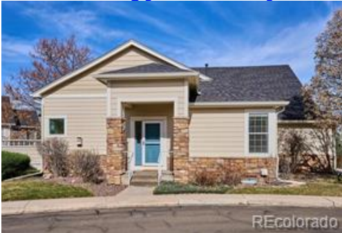
6687 S Reed Way Unit A $574,900

Call Gary for more information or a private showing of these or any other properties