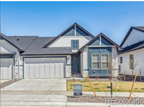
8224 S Queen St $824,900