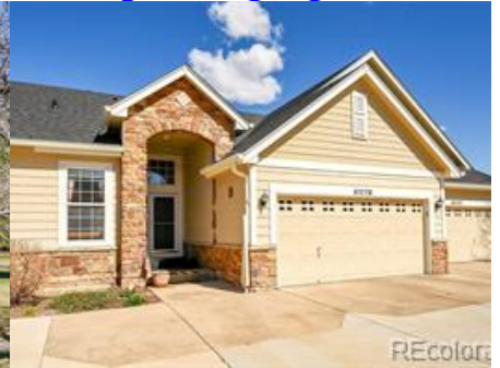
6577 S Reed Way Unit B $650,000