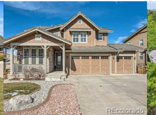
15705 Red Deer Dr $1,512,000