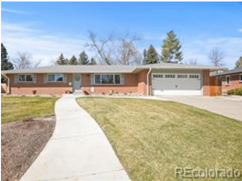
7035 S Gray Ct $899,000