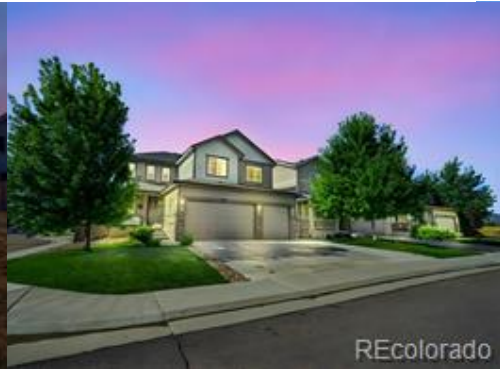
9862 W Rice Ave $949,950