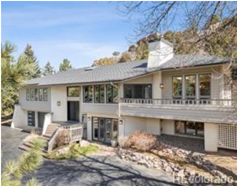
5852 Willowbrook Dr $1,950,000