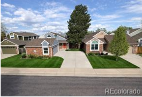
5301 S Cody St $620,900

Call Gary for more information or a private showing of these or any other properties