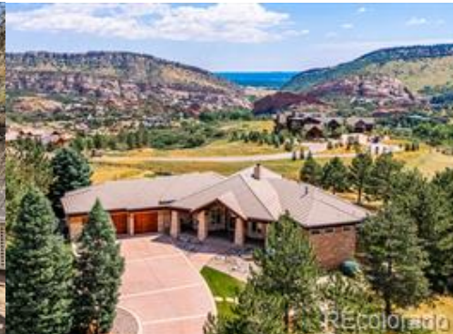
9560 Bear Claw Dr $3,000,000