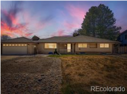
6376 W Roxbury Pl $730,000