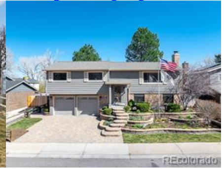
6306 S Johnson St $667,500