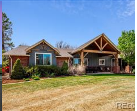
8830 W Bear Creek Dr $1,885,000