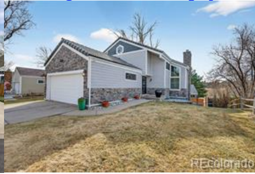
10772 W Berry Ave $625,000