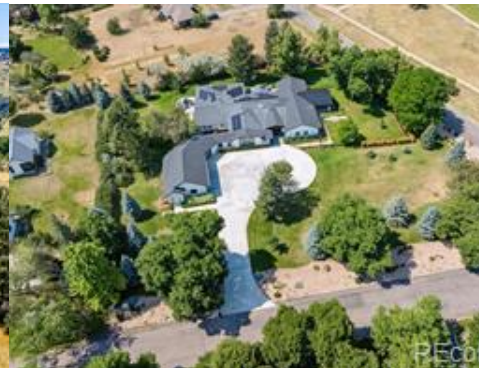
4900 Lakeshore Dr $4,300,000

I donate a portion of my commission to Childrens Miracle Foundation