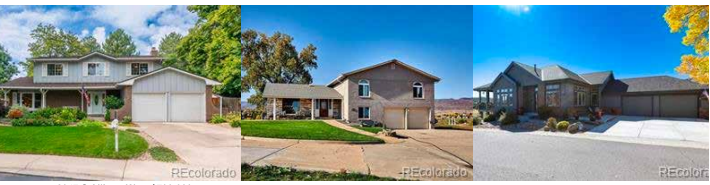
2347 S Allison Way $790,000