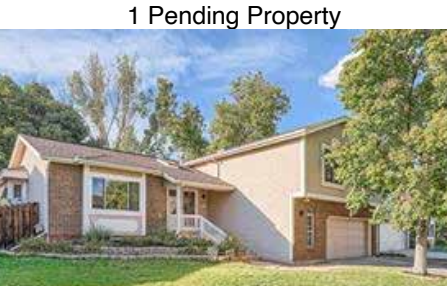
6351 S Pierson Ct $659,900

I donate a portion of my commission to Childrens Miracle Foundation