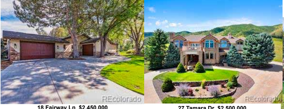
18 Fairway Ln $2,450,000