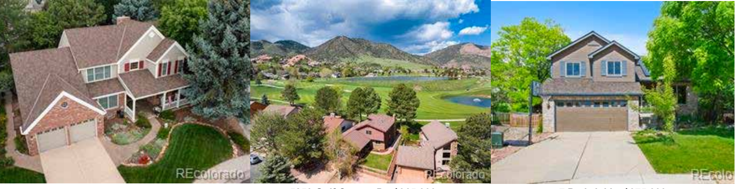
5455 S Hoyt St $925,000