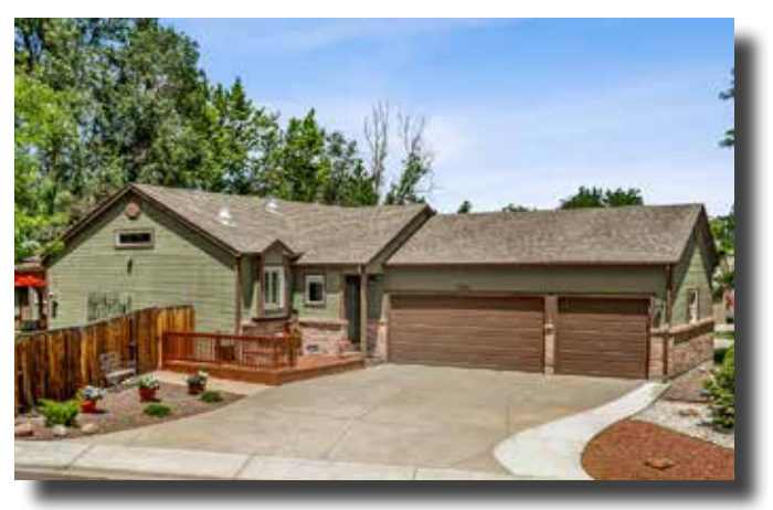
8019 W Hoover Pl.