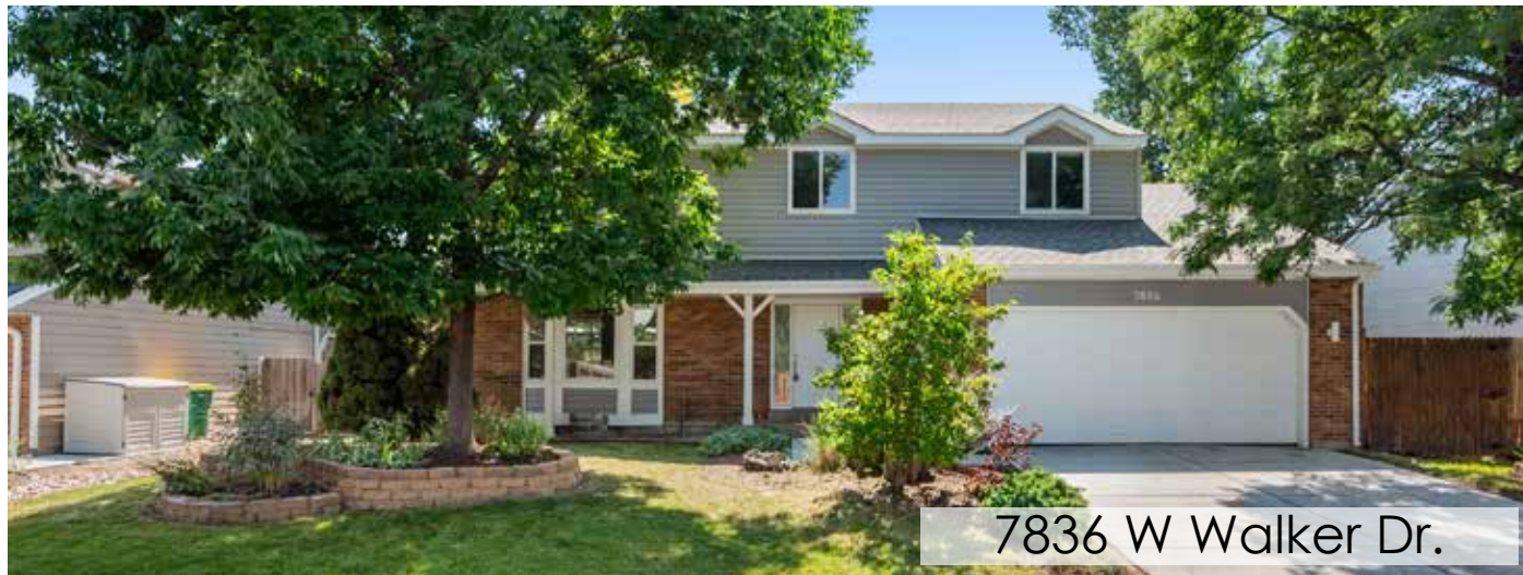
7836 W Walker Dr.